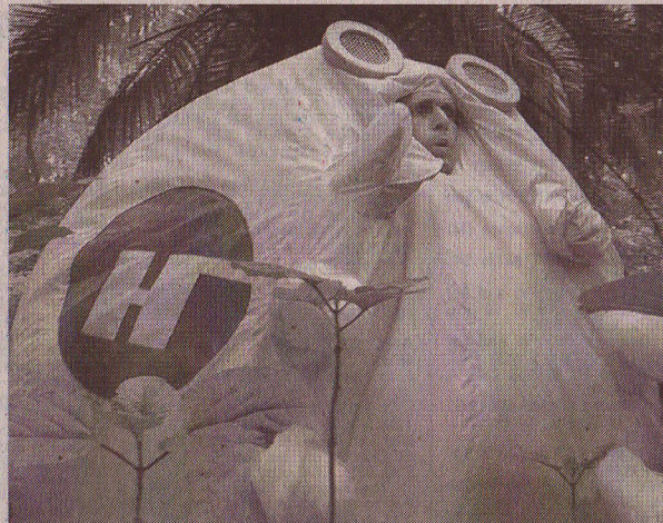
HBO DOCUMENTARY FILMS